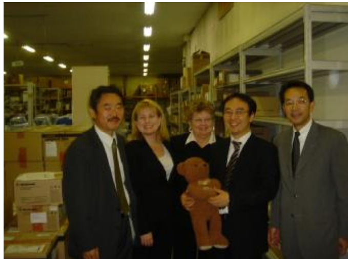
The CPR Teddy Sales Team