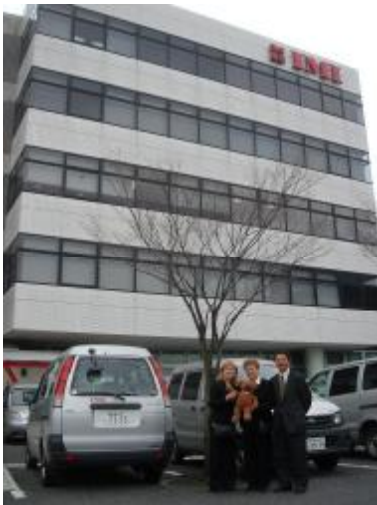
IMI National Headquarters